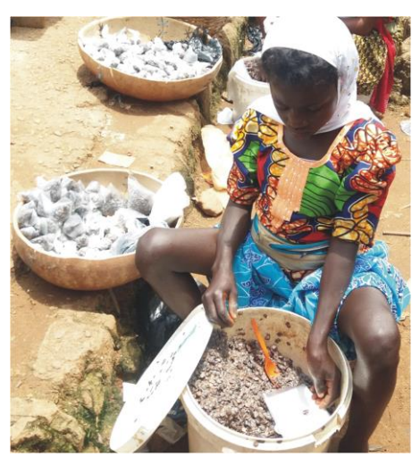
Figure 5: Unprocessed and processed locust beans sold in the market at Gbogan Osun State