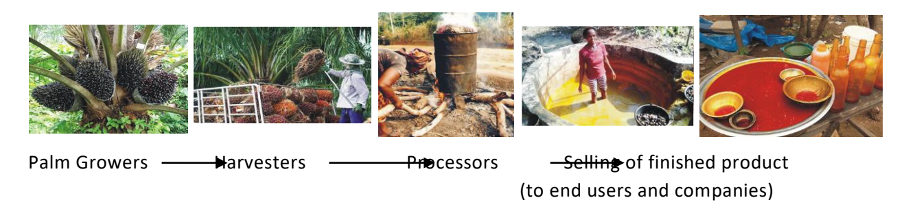
Figure 4: Value chain and income generation potentials of palm tree farming and palm oil processing (picture model developed by Authors)

There was a unanimous agreement that the palm oil and locust beans processing business are profitable. These findings corresponding with the findings of Adisa, Ayanshina, and Olatinwo (2014); Ifeanyieze, Nwapkadolu, and Nwareji, (2016); Iwuoha, (2017). The only set back was that when the sell through middle men, a big chunk of their profit is taken away. One of the respondents cited an example that, sometimes middle men buy finished products from them for about N6000 and resell in another community at N12, 000. That is twice the price of the cost. If processors were able to sell directly to end users at that price (N12, 000), then, they will have more profits. Figures 4 and 5 show the value chain and potentials for revenue generation for palm oil and locust beans processing.